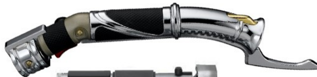
Yoda Episodes 2 and 3