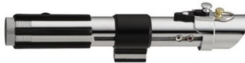
Mace Windu Episodes 2 and 3